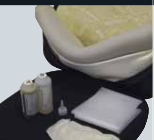
➤ Individually molded insert produced in minutes with user seated in back ➤ Optional high stretch cover available