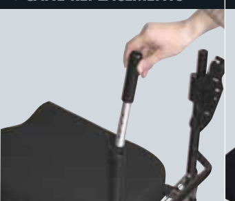
> Replaces existing back canes which are less than 1" diameter for use with any MaTRx back