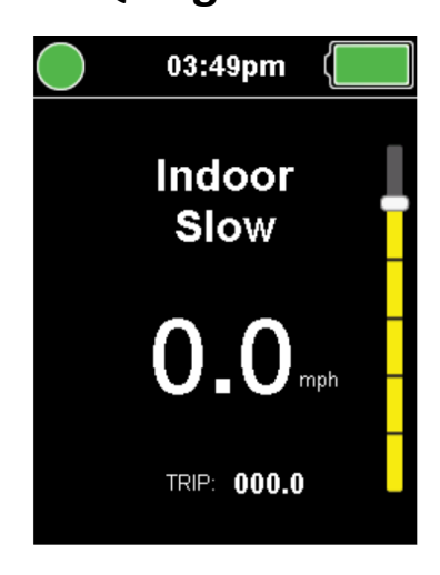
Q-Logic 3 EX Home Menu