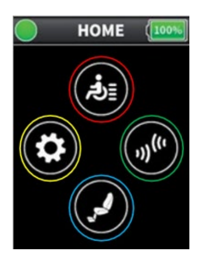
Has Bluetooth® for user connectivity