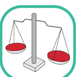
Total Weight Approx 13.8 kg