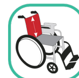
Back Height 16" Depth: 430 mm 18" Depth: 510 mm