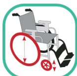
Wheels 8" Castors 24" Quick Release Wheels