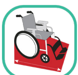
Overall Length 16" Depth: 1065 ~ 1070 mm