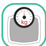
User Weight Limit 125 kg