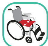
Seat Width 16", 18", 20"