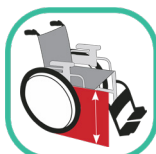
Seat to Floor Height 19.9"