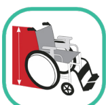
Overall Height 18" Depth: 1115 ~ 1120 mm