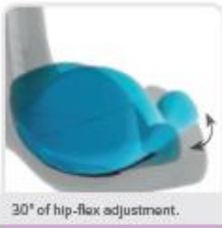
30° of hip-flex adjustment.