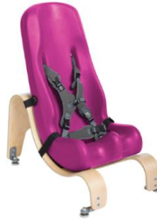
Sitter with Stationary Base