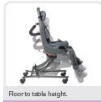
Floor to table height.