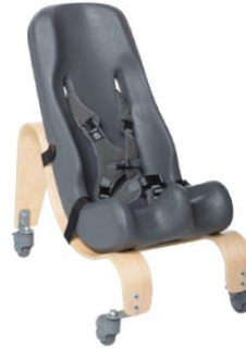
Sitter with Mobile Base