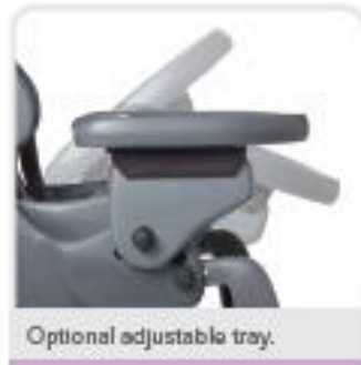
Optional adjustable tray.