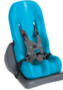
Floor Sitter Kit for Sizes 1,2,3