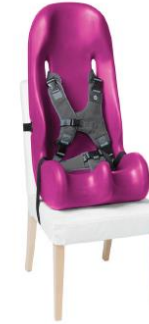
Applications Sitters can be used in a variety of ways