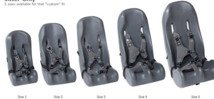
Size 1 Size 2 Size 3 Size 4 Size 5