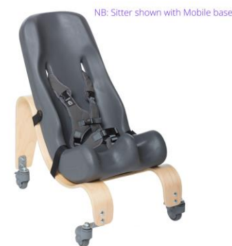
NB: Sitter shown with Mobile base