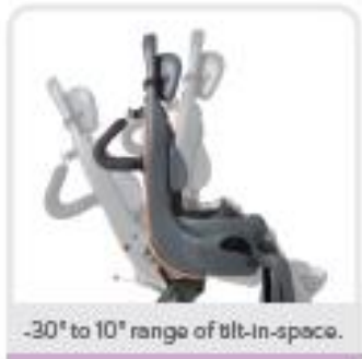
-30° to 10° range of tilt-in-space.