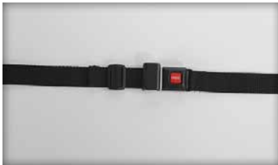
1" Auto Buckle

Using a double-pull to ensure the buckle remains in the proper position and attaching hardware for proper placement on the frame our new belts are an industry best value