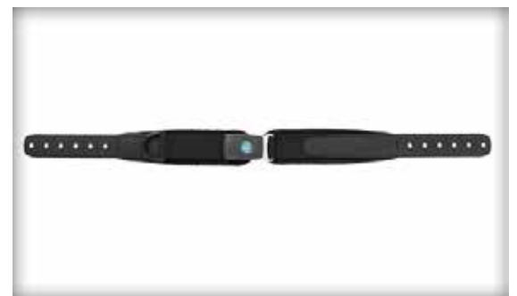
BodyPoint Evoflex Pelvic Stabiliser

Stays where you need it. Provides stability and flexibility. Versatile and easy to use. Stiffened end straps keep belt from twisting. Sized for users 15kg to 130kg. Available in Extra Small, Medium and Large.