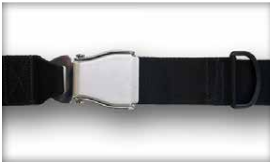
2" Airline Buckle

This belt uses an airline style buckle that can add a degree of security. It uses a wider 2" belt.