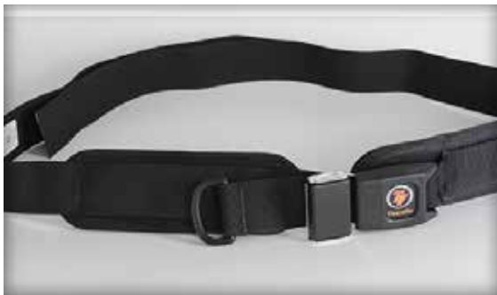
1.5" Padded Auto Buckle

This belt has a wide 3.5" pad for riders who may need additional padding.