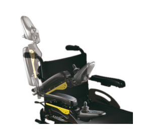
FLIP BACK AND HEIGHT ADJUSTABLE ARMREST