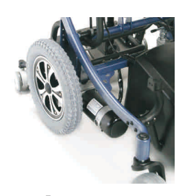
FRONT WHEEL DRIVE