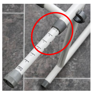
Figure 5 – Positioning the leg extensions

Place the frame around the toilet with the platform pushed back as close to the toilet as