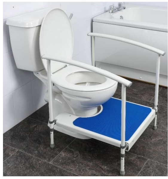
Figure 1 - Toilet Platform