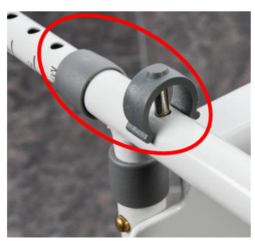
Figure 6 – Securing the leg extensions

To disinfect, wipe with a dilute bleach solution and rinse thoroughly with fresh water.